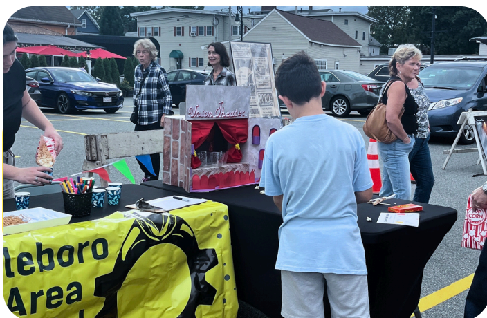
The museum hosts educational programming at events throughout the city. AAIM organized a STEM activity at the Union Theater Block Party (September, 2024).