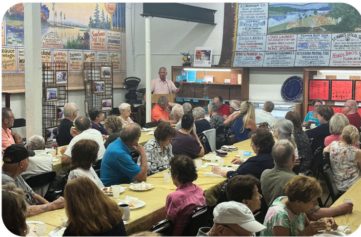
The Balfour Gold Dusters held their annual luncheon at AAIM celebrating their years of work at the Balfour Company (June, 2024).