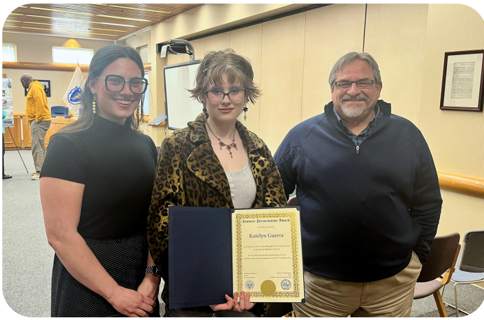
AAIM and one of its volunteers each received an award from the Attleboro Historic Commission for preservation work (May, 2024).