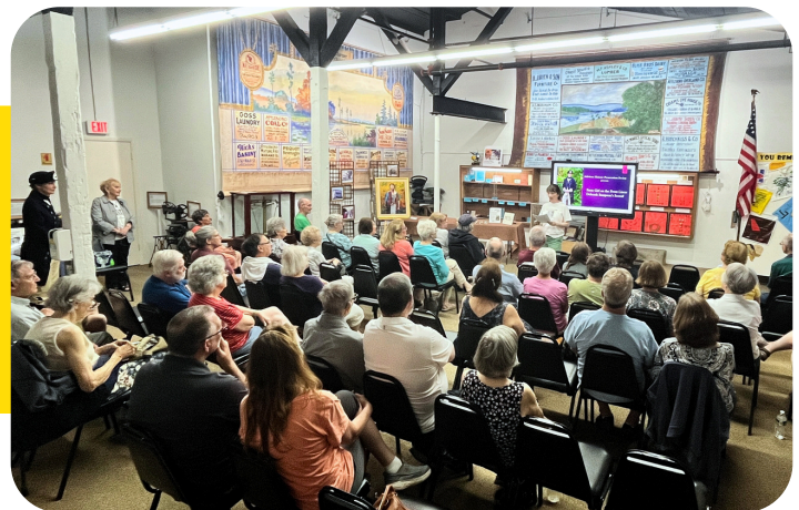
AAIM proudly partners with other organizations that share similar missions. The Attleboro Historic Preservation Society often hosts events at AAIM (June, 2024).